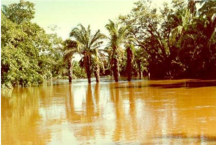
Flood stage on the Chané river, Santa Cruz department, Bolivia (January 1990).